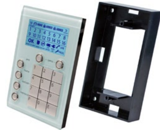
Surface mount backbox for mounting on hard surfaces Part No. 106-133 Sold separately.