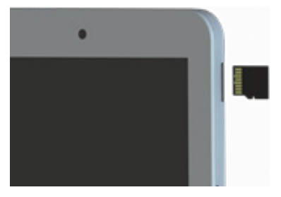
Figure 4. Inserting and Retrieving a Micro SD Card

Using a small pin or paperclip, push the Micro SD card in (towards the right of the unit if mounting in portrait). The slot will release the SD Card and a spring will push it out.