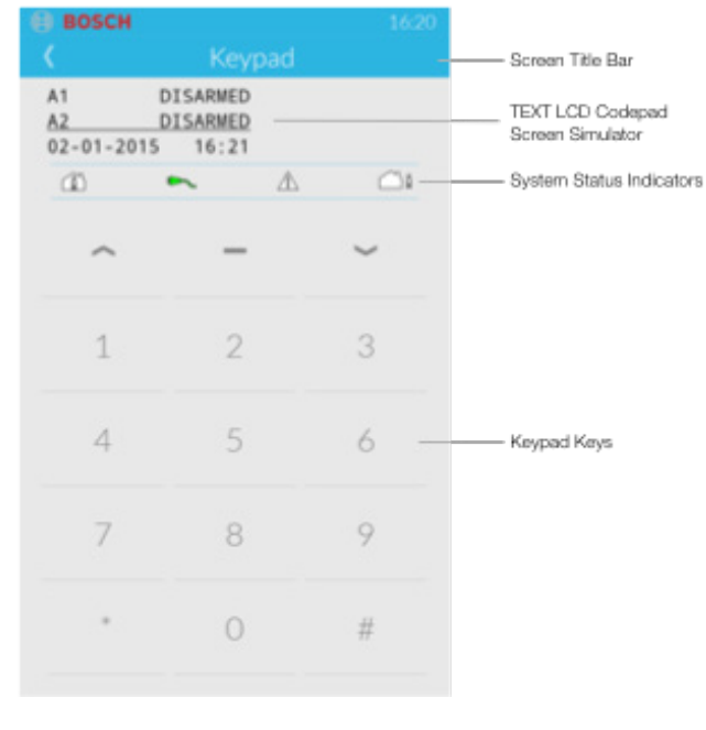
Figure 2: Keypad Screen

When you leave your premises and require all zones to be in a ready state to detect intrusion, arm the system in AWAY Mode. There are two different methods for arming the system in AWAY Mode. Method one is optional and can be disabled by your installer if you do not want to use single button arming. Method two is standard and always operates.